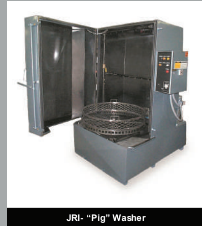
JRI- "Pig" Washer