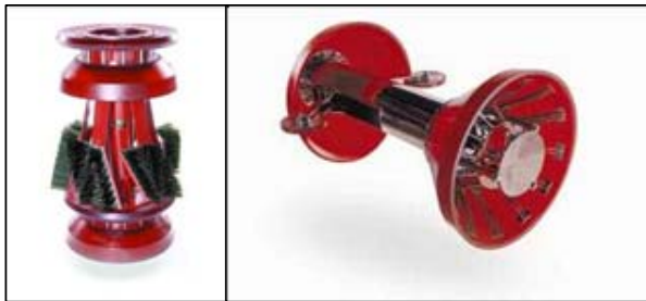
Examples of Pipeline Cleaning "Pigs"