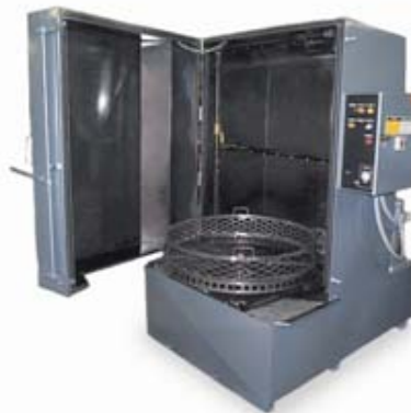
JRI- "Pig" Washer